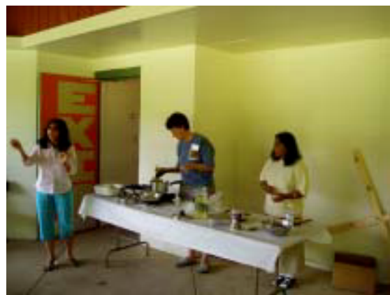
Cooking Demonstration at Midwest iChild Heritage Camp

India. Approximately, 50 children, ranging from 3–11 years of age and some 70 family members took part in the camp. IndUS and India Association NEW organized the Indian heritage component on Saturday, July 17, 2004. The morning session introduced the campers to Indian outdoor games such as kabbadi , lagori , langdi and of course, cricket! The afternoon session was devoted to presentations and hands on workshops devoted to rangoli , mehendi , cooking, basic Hindi and storytelling.