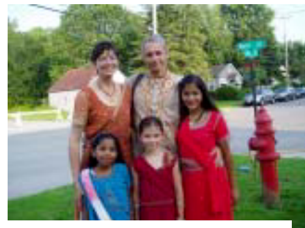
A family with adopted children