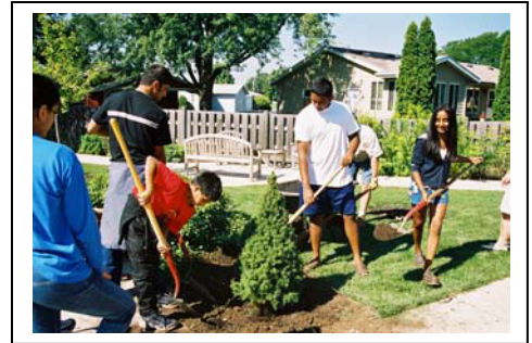
IndUS youth planting a tree at Evergreen Retirement Community, Oshkosh.

We will continue to collaborate with organizations such as India Association (N.E.W.), Toward Community, Human Relations Council, and areas schools and colleges in organizing activities that promote inter-cultural understanding.